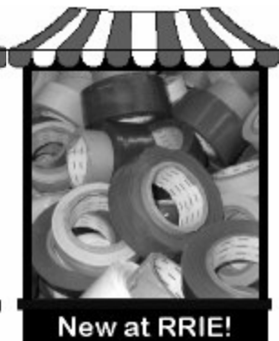
New at RRIE!

COLORED PLASTIC TAPE Clear artist tape and masking tape in different colors.