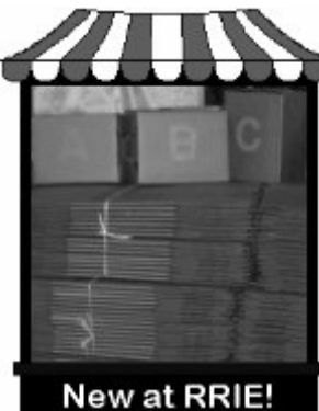
New at RRIE!

CHOWDER CUPS Great for crayons, paint, seedlings, etc.