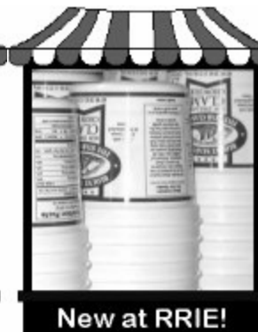
New at RRIE!

COLORED BEADS All sizes and shapes. Available in an array of colors.